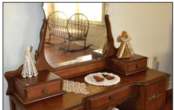
A baby cradle, made from green willow limbs in 1883, is reflected in a dresser mirror in the Fuller House at Heritage Park.