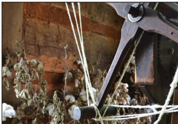
An old spinning wheel stands in front of cotton plants in the 1850s log cabin at Heritage Park.

Heritage Park provides those lessons with a variety of restored buildings, including an 1850s log cabin, a barn built shortly after World War I, a heritage museum, and even a replica outhouse. The impetus for the park began in the mid-1990s when word came that Euleless's first brick house was to be demolished.