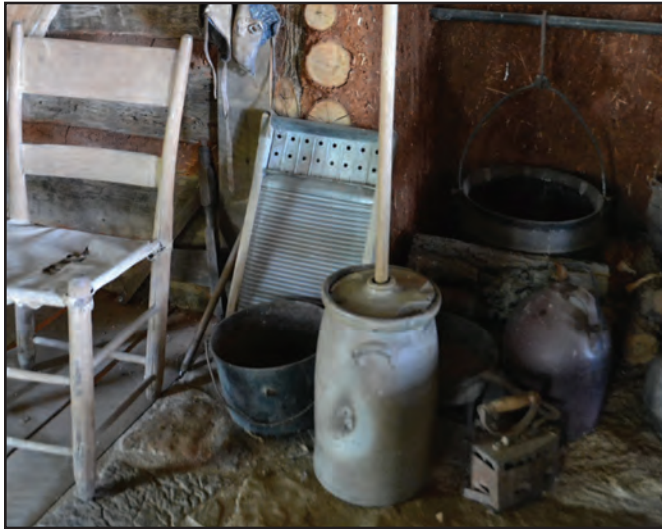
A butter churn, scrubbing board and oil lamp are among the items displayed in the 1850s log cabin at Heritage Park.

Also in Heritage Park is a recreation center that, by 1995, was used only for occasional meetings by local groups. As more donations came in, members of the newly formed Eules Historical Preservation Committee asked to store the items at the recreation center.