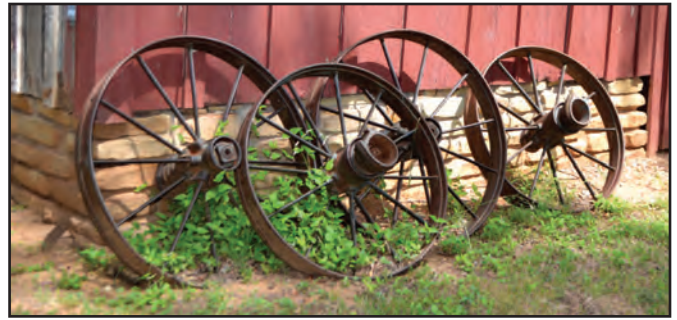
Old tractor wheels lean against the barn wall in Heritage Park.

Historical Preservation Committee and are there to answer questions or give tours. Visitors also are welcome to explore the various buildings on their own.